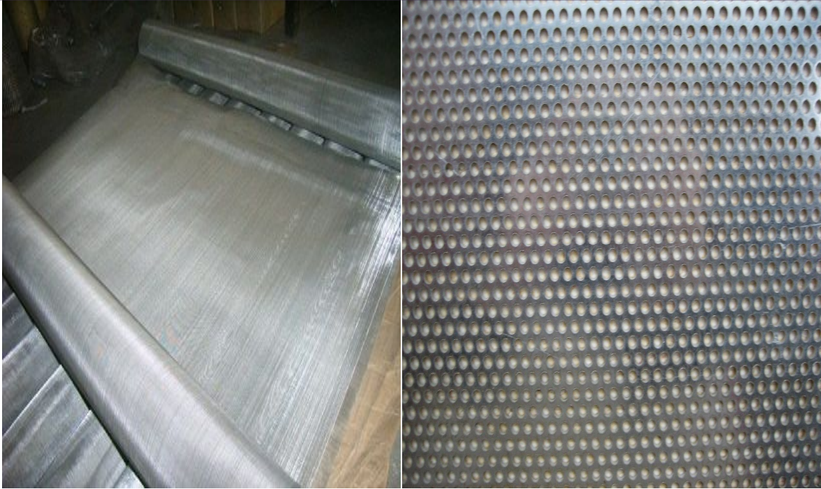
Aluminum Woven Mesh