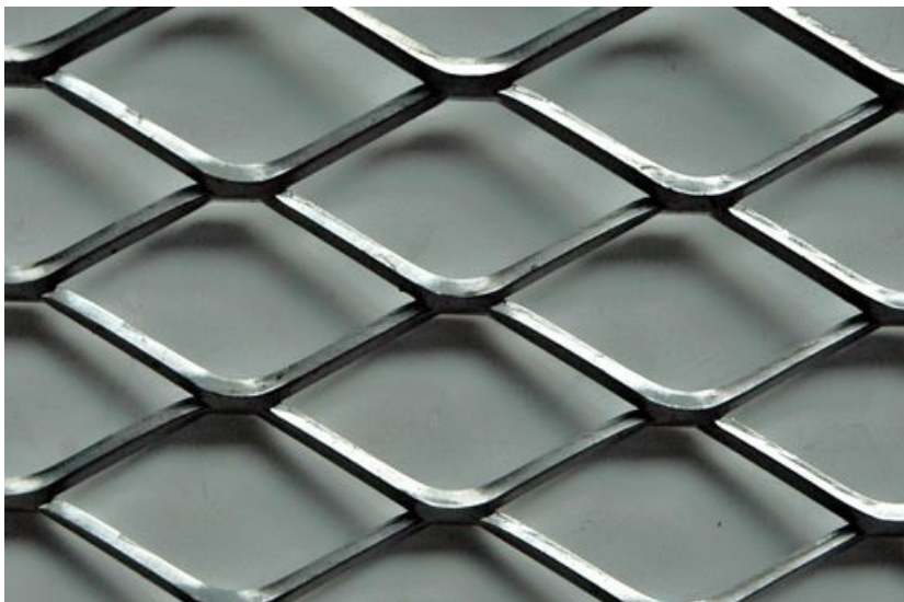
CuNi alloy 90/10 Expanded Metal Sheet

Cu-Ni alloy 90/10 mesh is a versatile, economical and low weight cloth, a suitable accent complement your unique design, it creates a flawless combination of function, security and protection. Heanjia Super-Metals offers mesh cloth that is fabricated in the different styles- woven wire mesh, expanded metal and perforated sheet. The woven wire mesh is produced