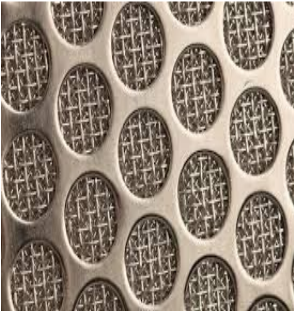
Sintered Hastelloy B-3 Metal

Since 1984, Heanjia Super-Metals has been committed to manufacturing the best quality custom mesh products in the industry. For applications ranging from basic separation to