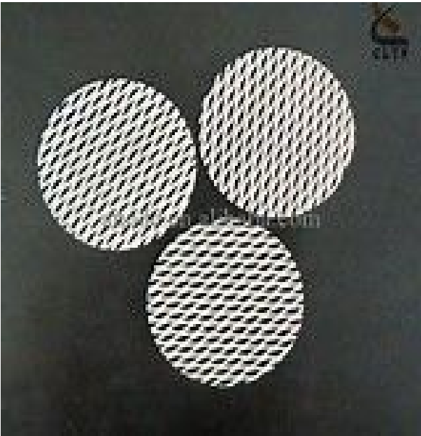
Expanded Hastelloy B-3 Metal