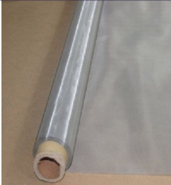
Woven Hastelloy C-22 Mesh