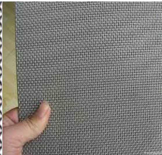
Sintered Hastelloy C-22 Metal

Depending on the application requirements, Heanjia Super-Metals can produce Hastelloy C-22 mesh into different weaving styles such as plain weave Dutch weave, Twill Dutch Weave and others with the filter grades varying up to 80 micros. The mesh products are supplied in rolls or strips for end fabrication by the filter producers.