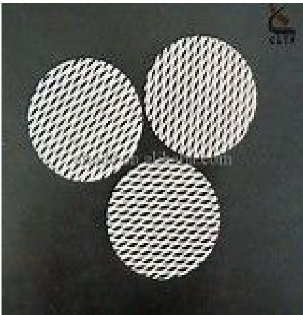
Expanded Hastelloy C-4 Metal