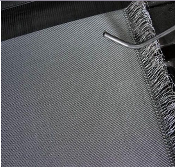
Woven Hastelloy C-4 Mesh