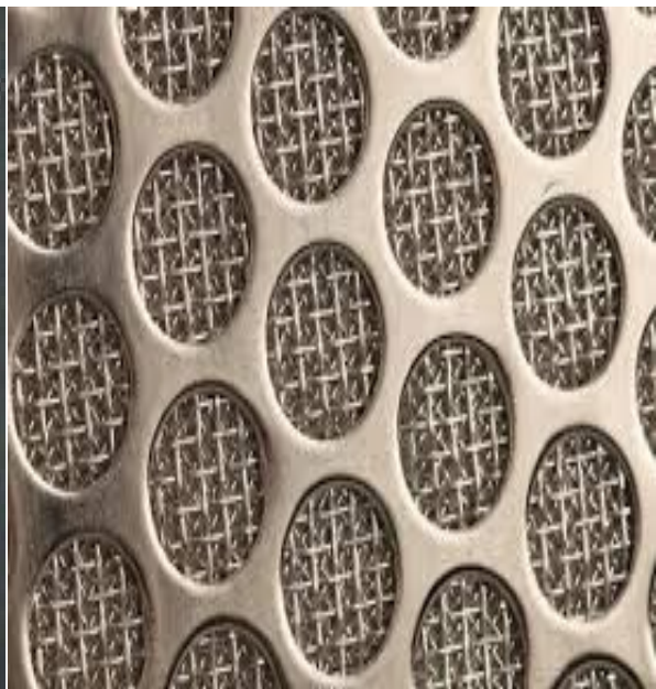
Sintered Hastelloy C-4 Metal

Whether you need mesh filter for use at low or high temperature, mild or extreme corrosive conditions, Heanjia Super-Metals is experienced in engineering the Hastelloy C-4 mesh products to meet your all filtration application requirements.