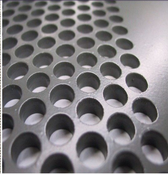
Perforated Hastelloy X Metal