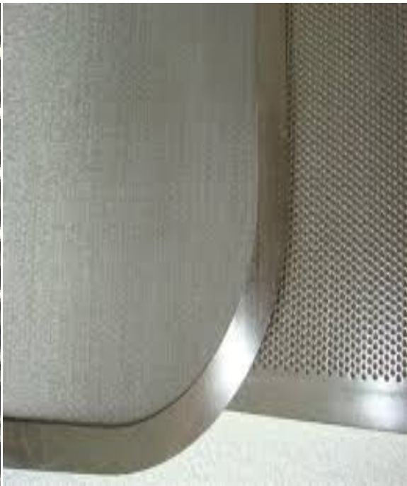
Sintered Hastelloy X Metal

Heanjia Super-Metals delivers Hastelloy X Mesh products for use in the several common applications including filters, strainers, gas diffusion, dewatering, burners, vents, dryers and others.