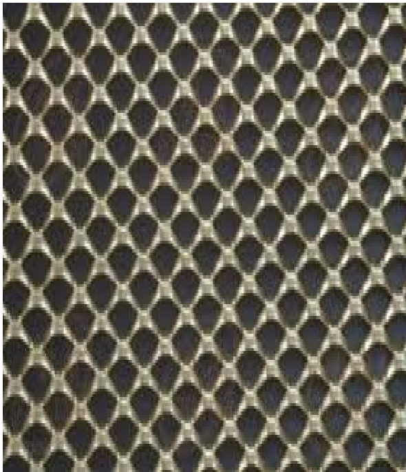
Expanded Hastelloy X Metal