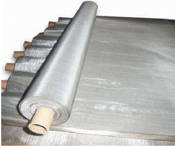
Woven Inconel 601 Mesh