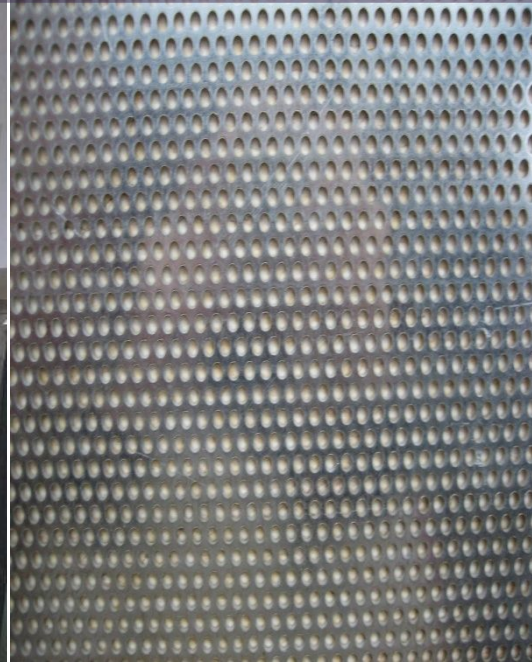
Perforated Inconel 718 Metal