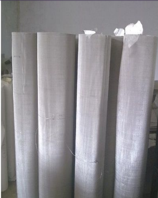
Woven Inconel 718 Mesh